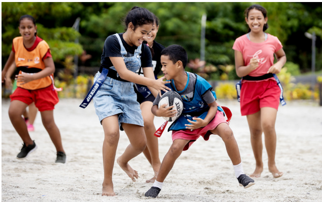
New Zealand Rugby's Quickrip programme, Samoa.

While the strategy is anchored in advancing New Zealand's global interests through sport, it has a particular focus on the Pacific. Nowhere else does the power of sport hold greater potential for New Zealand than in the Pacific.