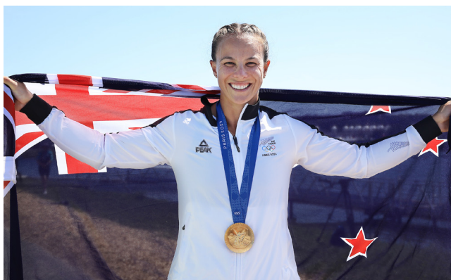
Dame Lisa Carrington – Women's Kayak Single (K1) 500m Gold, Paris 2024 Olympic Games.

New Zealand's prosperity relies on strong international relationships to support our export, foreign investment, education and tourism sectors. Trade is a key driver of employment and income, while foreign investment is vital to our economic success.