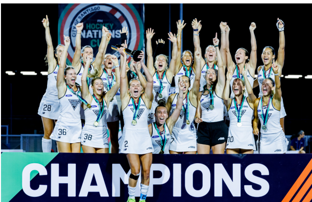
New Zealand Black Sticks – 2025 Nations Cup winners, Chile.

The strategy also seeks to improve the quality and effectiveness of New Zealand's sport diplomacy activations. To maximise the long-term benefits from these sporting opportunities, government agencies and sporting organisations must continue to improve the quality and effectiveness of their leveraging expertise and capability.