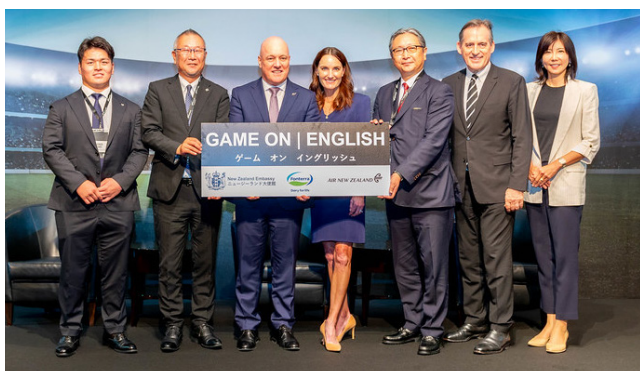
Sports and Business Leadership Luncheon – New Zealand Government Trade Mission to Japan, 2025.

Critical to this approach is having a good understanding of the in-market ambitions and focus of the various government agencies and their customers. Matching the business imperatives (the need) with the most appropriate sporting opportunities (the supply) has the potential to return increased benefits for New Zealand.