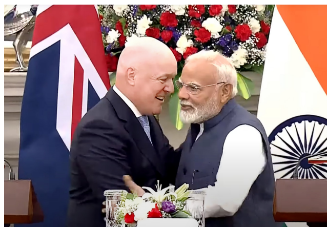
Prime Ministers Luxon and Modi acknowledging the celebrations of 100 years of sporting ties between New Zealand and India in 2026.

New Zealand is recognised as having world-class sporting innovation, systems and programmes.