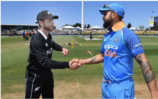
New Zealand Black Caps versus India, 3rd ODI, Bay Oval, Mount Maunganui, 2019.

A strength of New Zealanders is their ability to connect and collaborate with others. Our prosperity, resilience, security and sporting success depend on building relationships founded on respect, care and reciprocity – our manaakitanga.