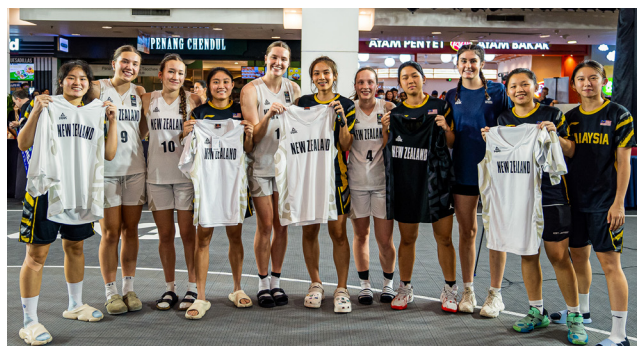
New Zealand U23 women's basketball team – winners of the FIBA 3x3 Nations League, Malaysia, July 2024.

Work with the sport sector to strengthen New Zealand's global representation and ongoing influence.