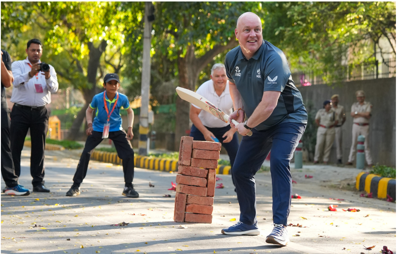
Prime Minister Luxon playing street cricket – New Zealand Government Trade Mission to India, 2025.

In doing so, this strategy supports wider government outcomes of building a safer, more prosperous and sustainable future for New Zealand.