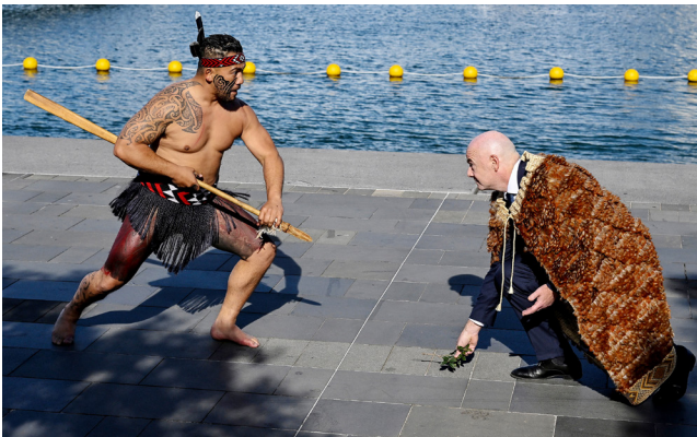
FIFA President Gianni Infantino – pōwhiri, 2023 FIFA Women's World Cup, Auckland, New Zealand.

At its heart, the strategy is about using the context of sport to enhance New Zealand's global understanding and reputation, through people-to-people connections and our storytelling capabilities.