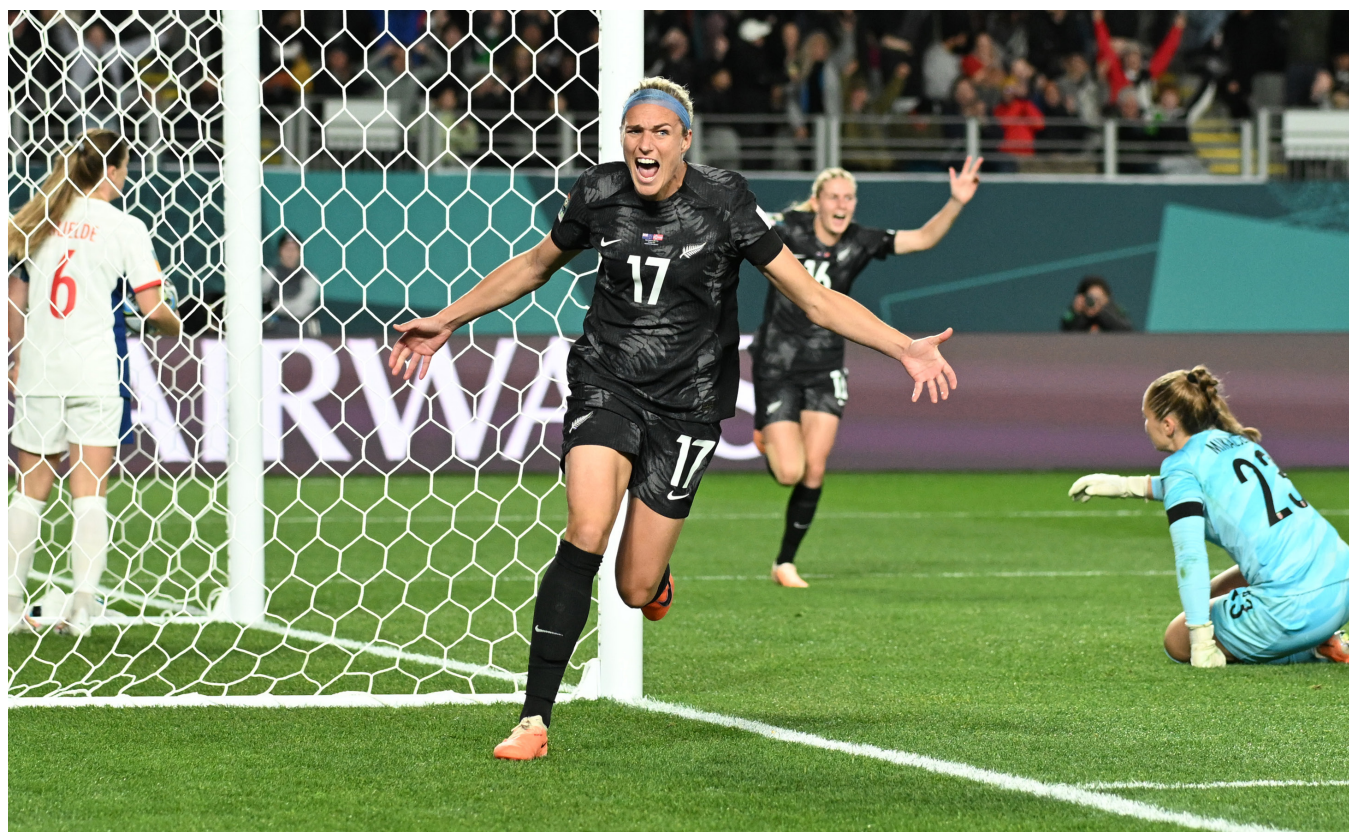
2023 FIFA Women's World Cup, New Zealand versus Norway, Eden Park, Auckland.